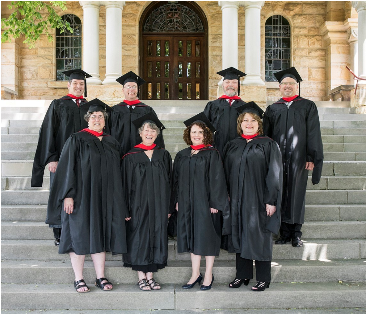
Photographed Students from the Archdiocese of Indianapolis