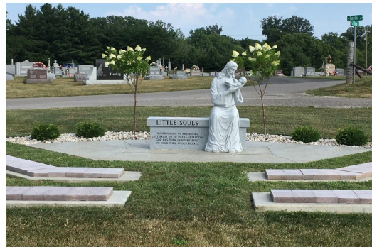
St. Mary's Little Souls Cemetery