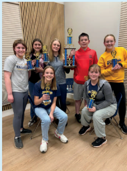
Our Winning Seventh Grade BOB Team.