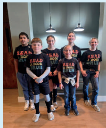
Our Sixth Grade BOB Team.