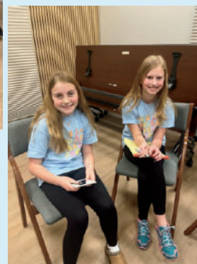
Our Fifth Grade BOB Team.