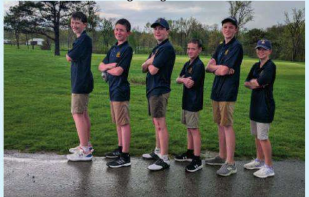
Our 7th and 8th grade golf team members.