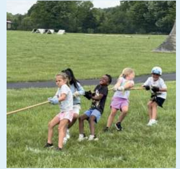
Kindergarten students give it their all in sack race and tug-o-war.